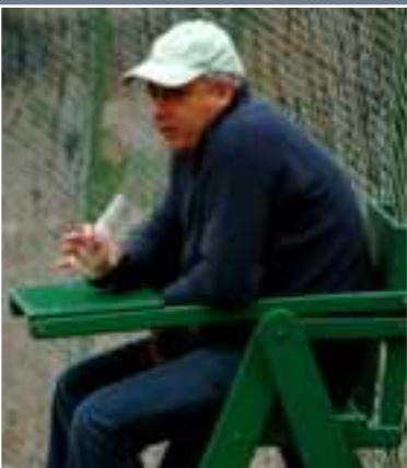
Quick! The umpire has run out of beer

Beer, wine and other alcoholic and soft drinks available